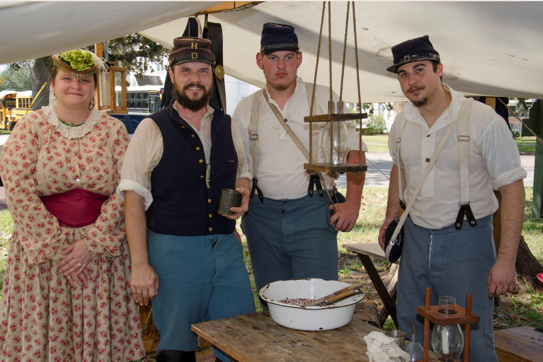
Occupation of Palatka