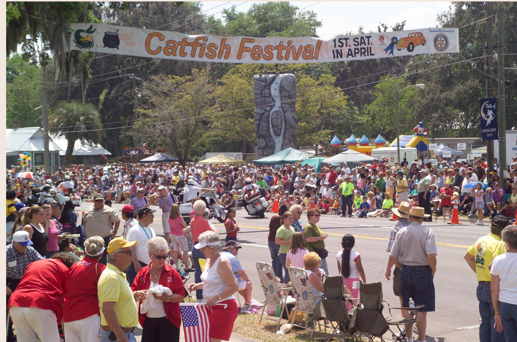
Crowd at Catfish Festival

Proof of ad running from the date it appeared or a recording of broadcast media. We need to be able to tell what distribution was used and the date the distribution channel was used.