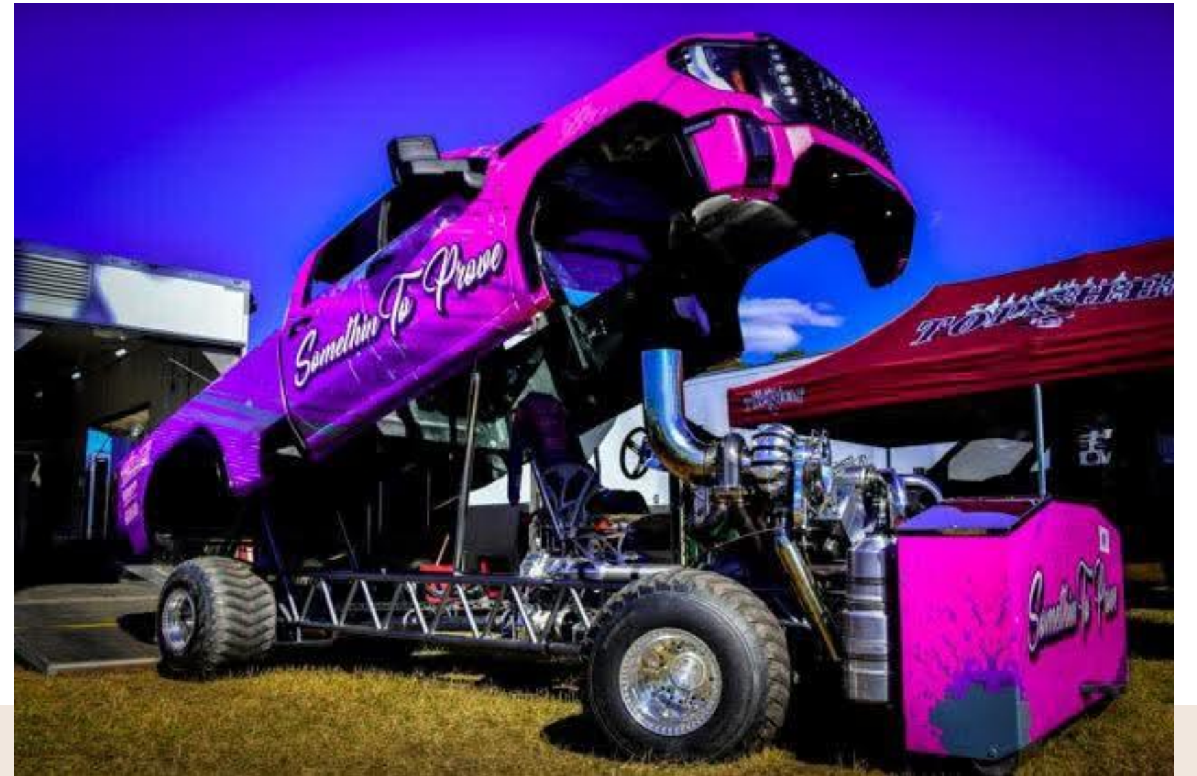
NTPA Southern Swing Tractor Pull