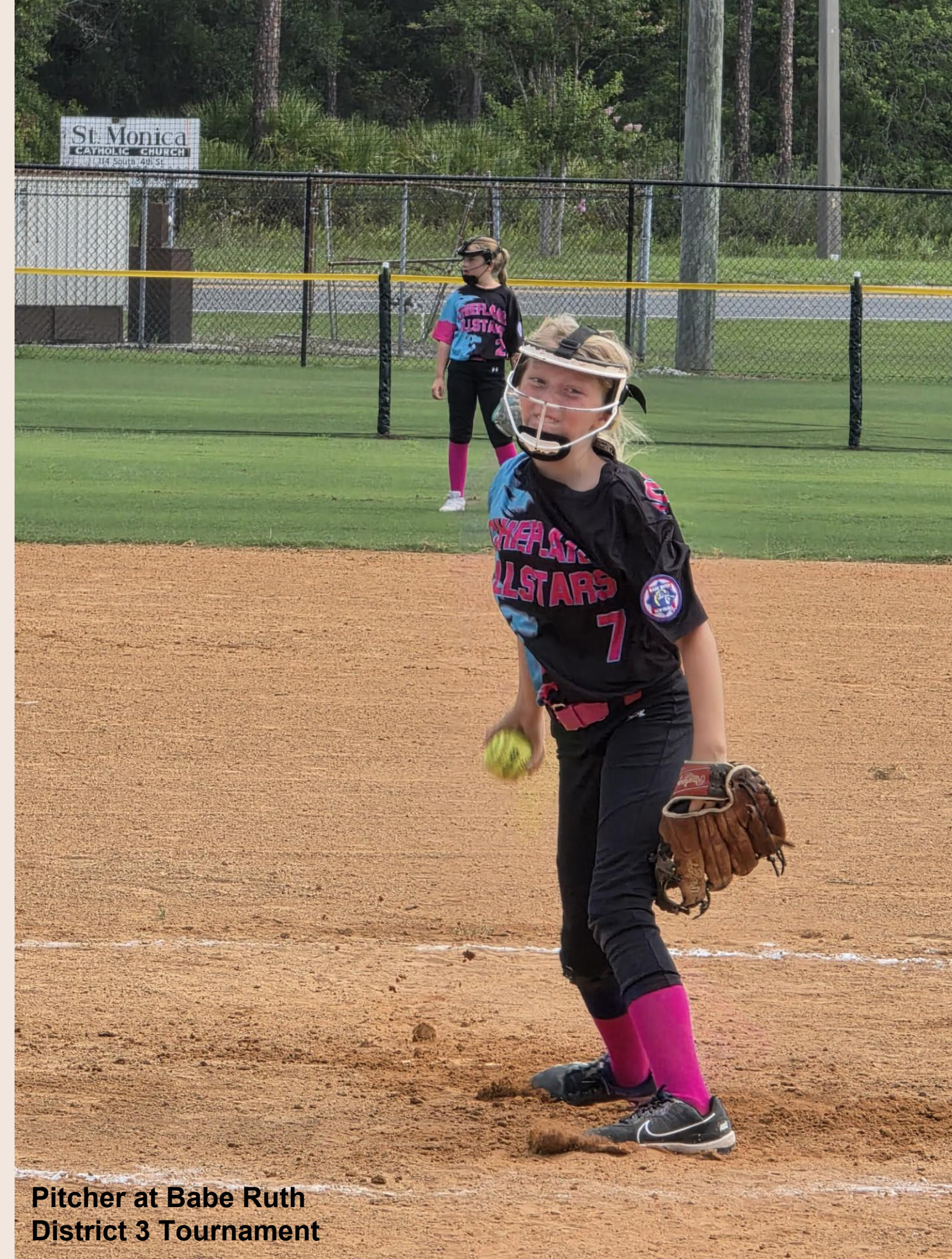
Pitcher at Babe Ruth District 3 Tournament