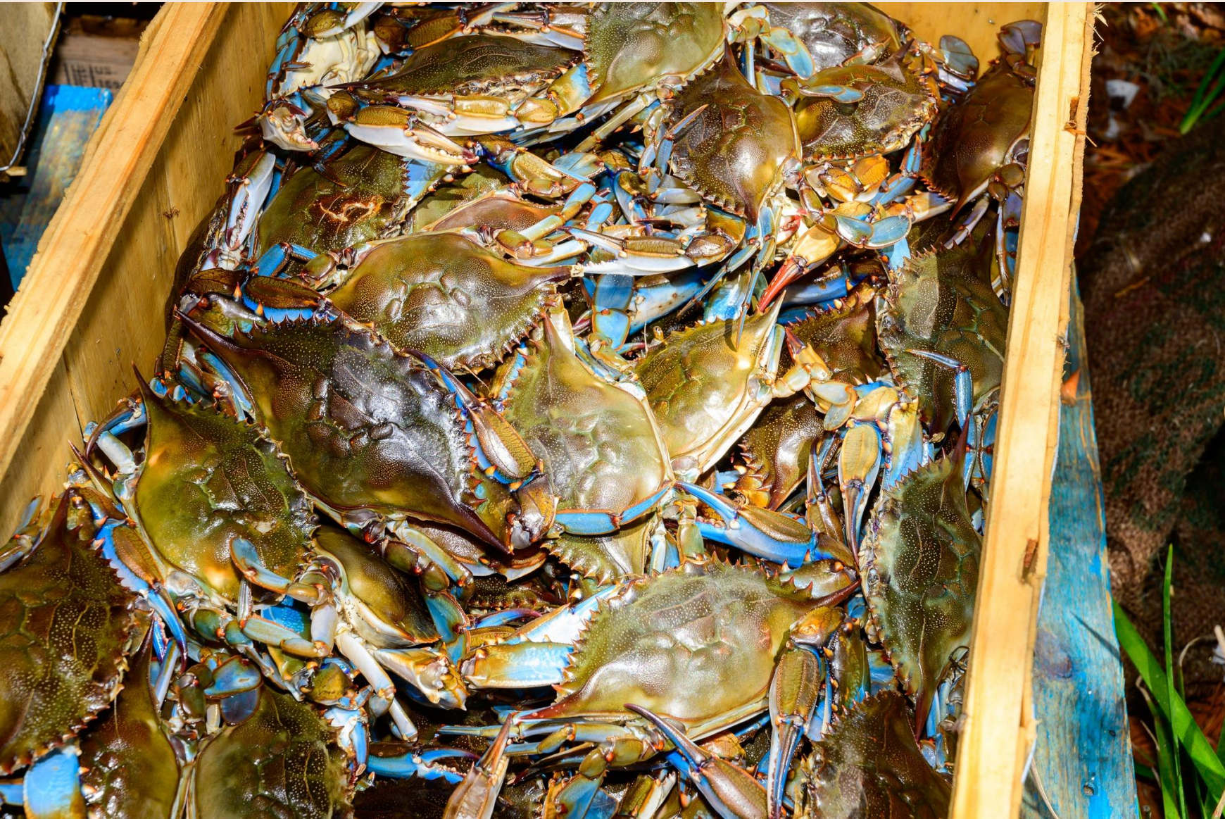
Blue Crab Festival