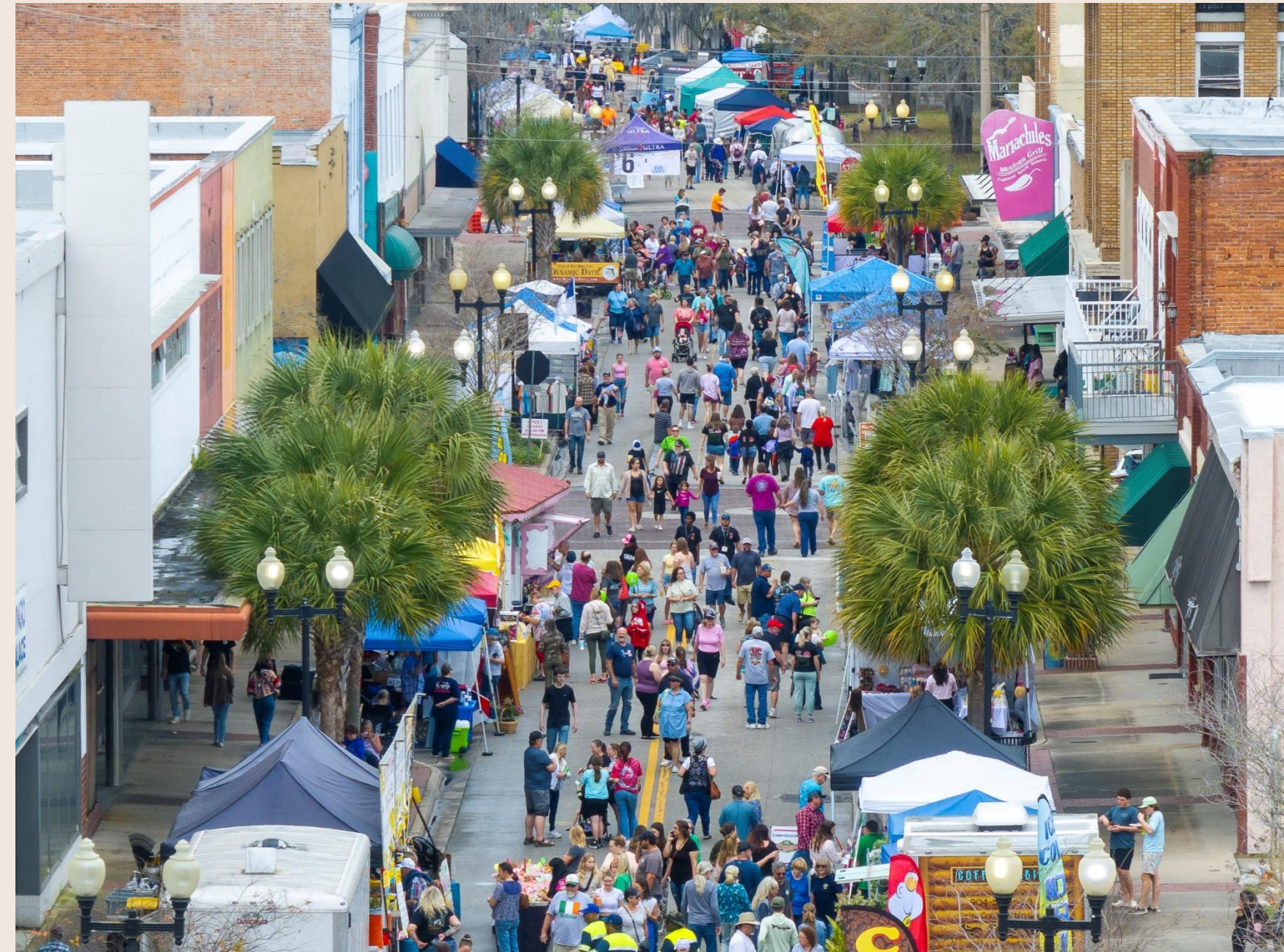
Azalea Festival Crowd

Use Destination Research – last year’s event data, website analytics, social media analytics, and county tourism analytics