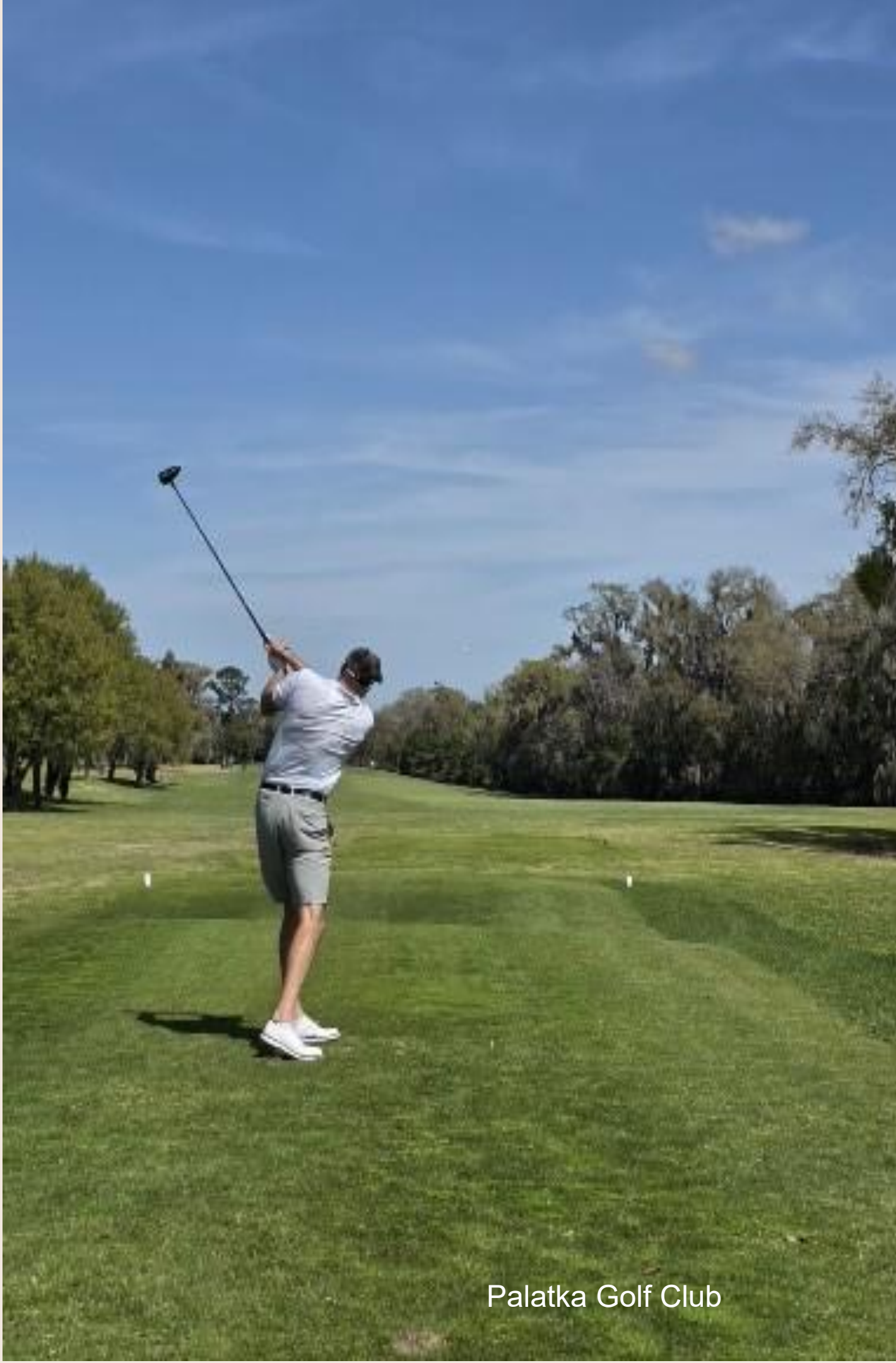
Palatka Golf Club