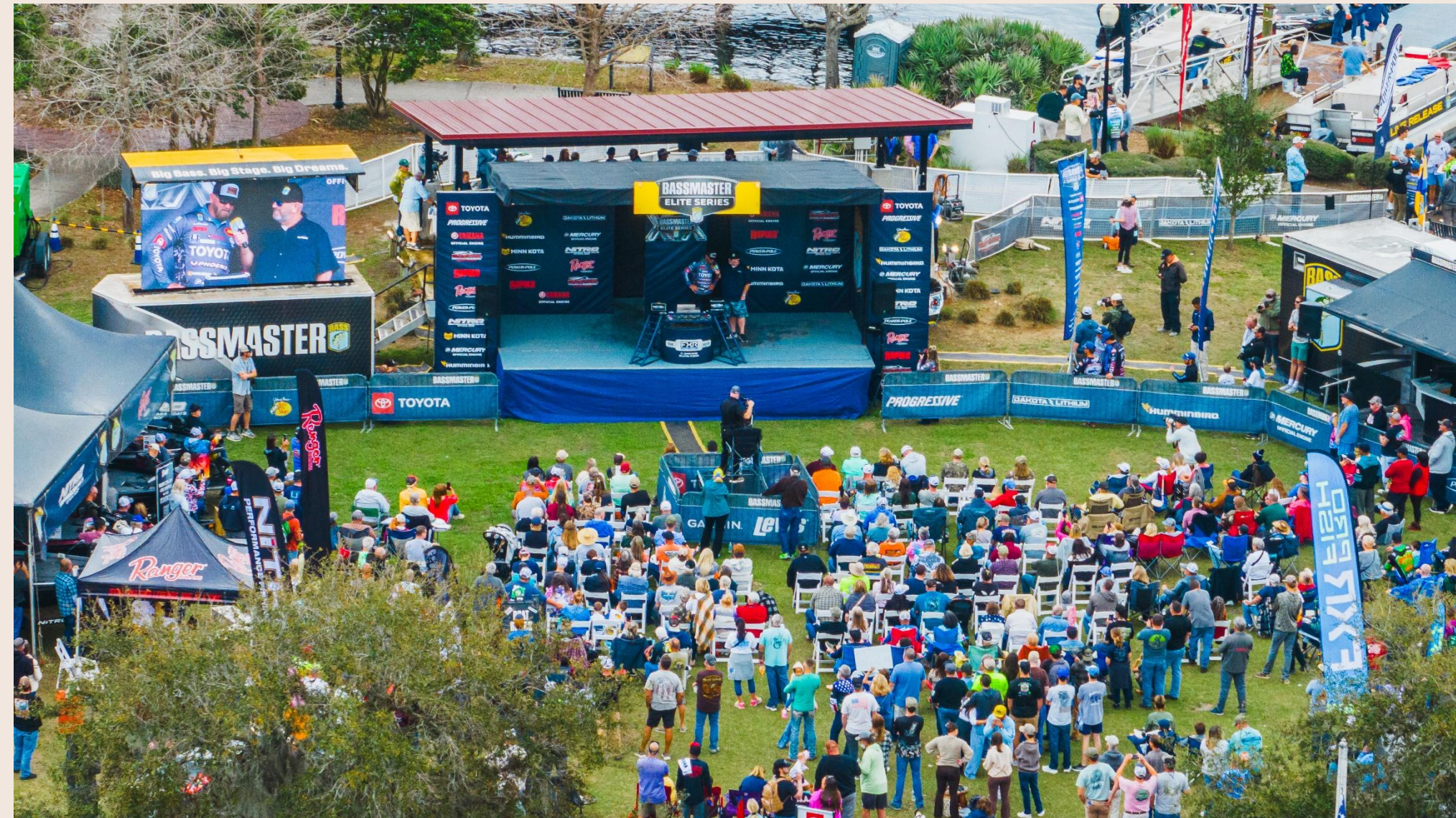
Crowd at 2025 BASS Elite